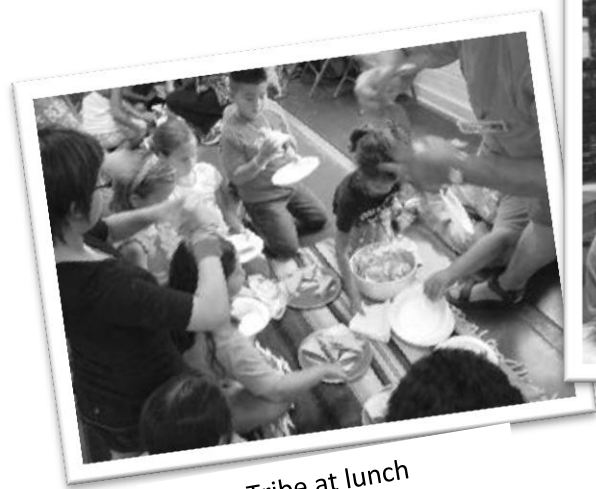
Tribe at lunch