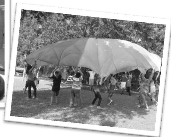
Fun under the parachute tent